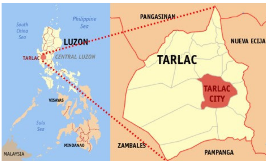
Figure 3 Location Maps 2

Tarlac city is a 3 rd class and the only city in the province of Tarlac. The city has a population of 262,481 people in 51,703 households divided in 76 barangays.