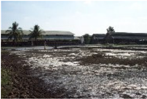
Figure 1 Lagoon, The Local Common Practice

HBC proposes an alternative manure waste management system to recover methane gas emissions as an alternative to the current open lagoon systems. Wastewater treated in these lagoons is often at an ambient temperature of around 35°C, and under anaerobic conditions. The result of this is that biogas methane is emitted continuously from lagoons as can be seen in this typical farm lagoon system image.